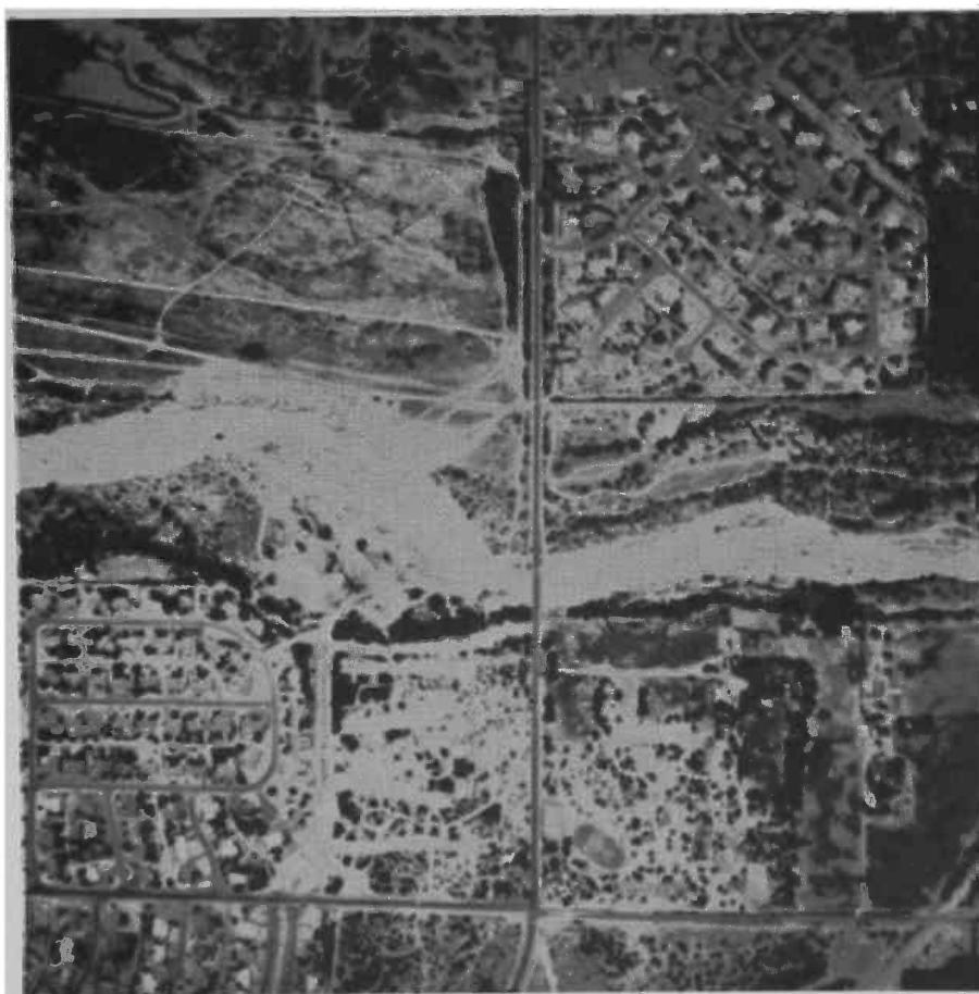
Fig. 3.—Encroachment of the outer city suburbs into natural drainage systems and livestock areas increases mosquito and house fly problems.