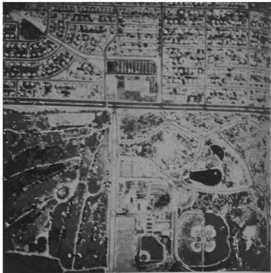
Fig. 2.—A high diversity of turf and ornamental plantings exemplify inner city residential and recreational areas of Tucson.