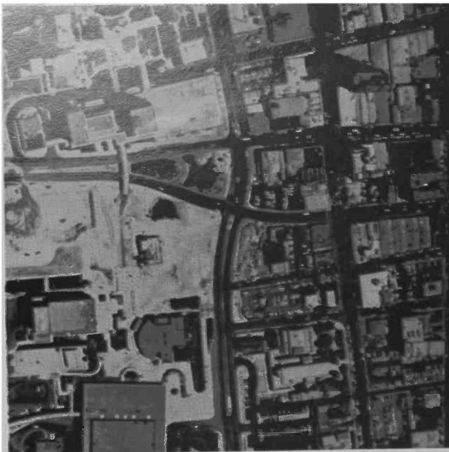
Fig. 1.—The predominance of concrete over landscape plantings of the inner city area of Tucson.